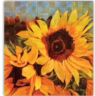
Dove Creek Sun 12"x 12" Watercolor by Pat Howard

Known for bright and inviting watercolors, with intriguing contrasts of patterns and textures, Pat Howard's career has fully merged with her Colorado environment. Pat has been shown in national exhibitions, including the Rocky Mountain National Watermedia Show in Golden, Colorado, and the Adirondack National Exhibition of American Watercolors