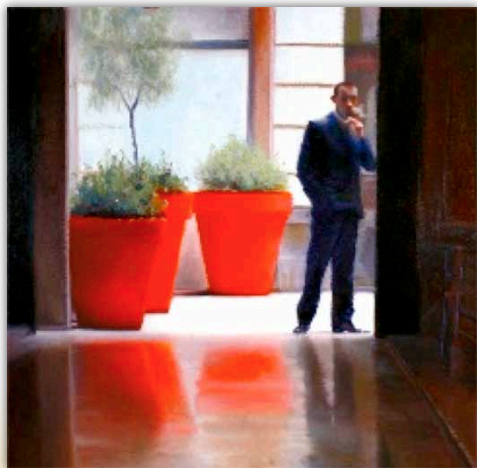
Where There's Smoke

more success. But he says that promotion and production are the most difficult aspects to being an artist. "My resume is my canvas. The paintings I've