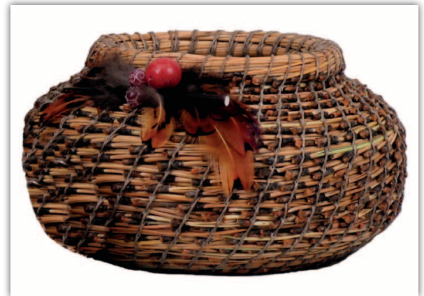
Pine Needle Basket

Basket weaving is one of the oldest crafts. There are multiple forms of basketry designs reflecting diverse traditions and locations. Mimi Bonkowske was attracted to the basketry medium as a natural form of self-expression. The lore, the beauty of the art and spiritual investment, all play a key role in her wonderful creations.