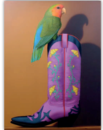
Cowgirl Giclée 40"x 30"

"I LEAD A COLORFUL LIFE. THE ONE CONSISTENCY (IN MY LIFE) HAS ALWAYS BEEN MY ART."