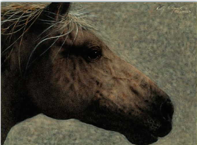
Diligent Journey Giclée 22"x 30"