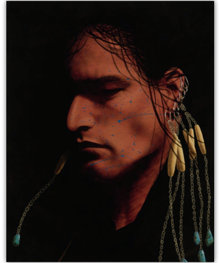
Silent Prayer Giclée 30"x 22"