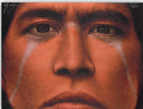
Visionary Giclée 22"x 30"

It seemed he was destined to end up in an artistic community such as Taos. He was discovered by R.C. Gorman