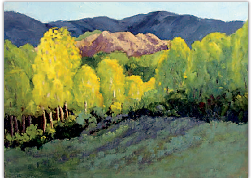
Old Lime Creek Road