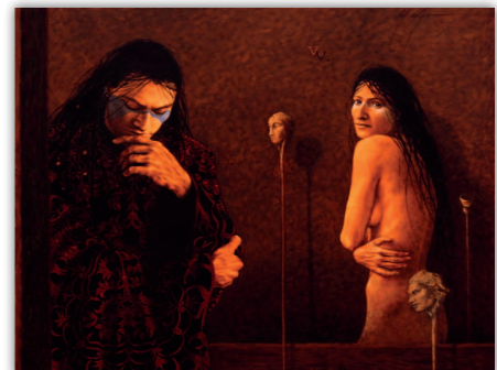
Favorite Things V Acrylic 40"x 50"

Through the years, his artwork has been placed in public and corporate settings, as well as private collections nationally. His career seemed to be ever growing, garnering a greater following year after year. We will all miss his wonderful creativity and intriguing compositions, while remembering him in the legacy of paintings he's left behind, today and for all time. ✨